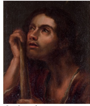
Santiago el menor