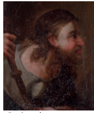
Santiago el mayor